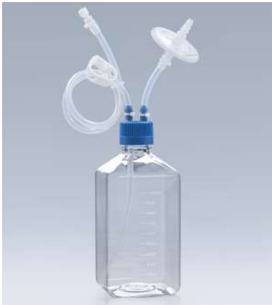
Bottle With Two Ports Tubing