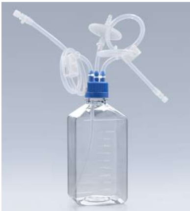
Bottle With Three Ports Tubing