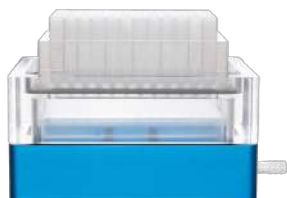
Universal Vacuum Manifolds

The manifolds are adapted to 48/96/384 well plates and Luer-inlet columns to eliminate repetition of pipetting and centrifugation in traditional nucleic acid extraction methods.